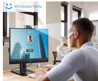
WINDOWS HELLO CERTIFIED Facial Recognition for Safe Single User Sign-On